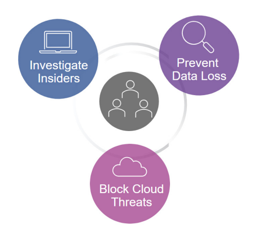
Figure 1: One Console, One Agent, One Cloud-native platform, with common alert management and investigations, policy uniformity, privacy controls, reporting and analytics.

Our platform lets you enforce stricter controls for high-risk users. These users can be highly targeted or vulnerable. They can also be members of privileged groups, such as admins and VIPs.